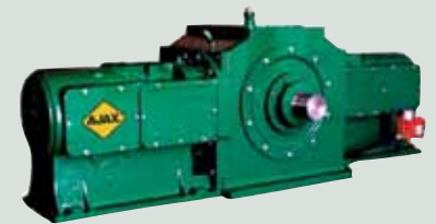
Electric motor driven separable

The C-302 only has four new parts – the frame, flywheel, crank shaft and drive hub.